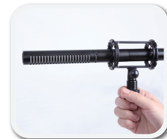
3. Push the mic through shock mount

4. Make sure do not block the slots on the side of the mic, as blocking will effect sound quality and polar pattern. And please remove the battery from mic when the mic isn't in use.