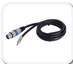
Cable with 3.5mm Plug