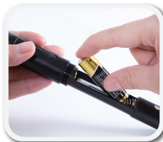
2. Insert a AA battery