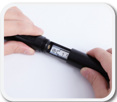
1. Unscrew the battery case